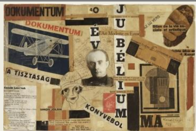
'40 Years Jubilee'. Collage made for Lajos Kassák's 40th Birthday by his colleagues, 1927. Kassák Museum, inv. no. KM-M-79.3.1.

EUROPEAN SOCIETY FOR PERIODICAL RESEARCH (ESPRIT)